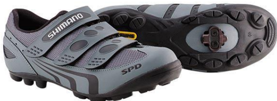
Photo 2: An example of a pedal system where the cleat can be clipped into the pedal from either side.

Photo 1: Note that the cleat is recessed into the shoe so that the sole will come into contact with the ground as if the clip as not there.